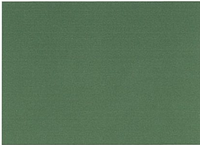
#808 - Light Green