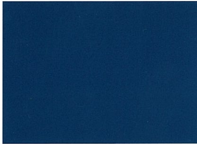
#124 - Dark Blue