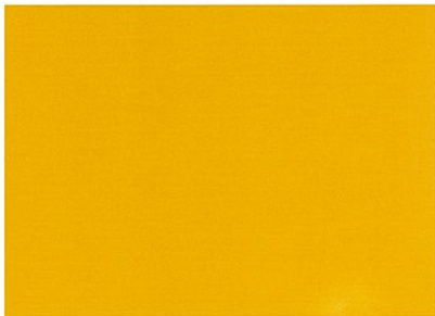
#126 - Yellow