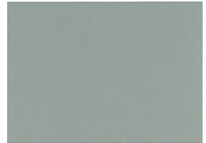
#175 - Shelf Grey

Colors shown are standard and can be selected at no additional cost. Custom colors can be quoted upon request.